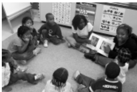
Link seventh graders read to preschoolers at Community Hills Early Learning Center in Newark as part of the Share a Story campaign.