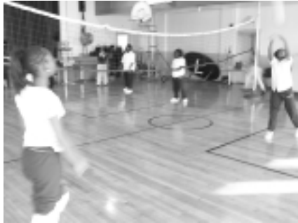
The Link volleyball team practices in the gym.