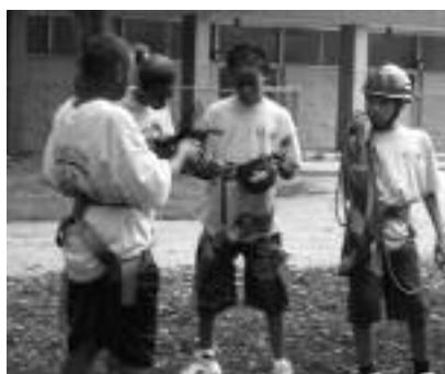
Students get ready to climb a wall.

a daily morning meeting during which teachers shared inspirational messages, celebrated students and made announcements, and then attended math and language arts classes. Three days per week, they attended a Portfolio Session during which they reflected on their lives and their experiences at the