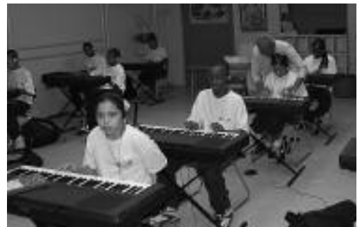
The refurbished Music Lab

in a room with freshly painted floor and walls, new lighting, expanded space, and most importantly a ventilation system that brings a fresh exchange of air to the room. Link extends its most sincere gratitude to our partners on this project! ■