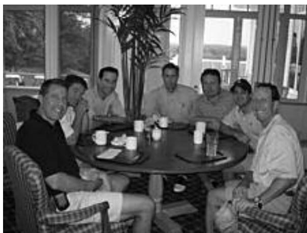
Relaxing a little with friends before the big start