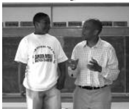
Corey Booker includes a student in his presentation.

Link Community School is especially grateful to those partners who made the 2005 Academy possible: Playsmart, Athletes in Action, Chelsea Piers Sports and Entertainment Complex, and the Junior League of Montclair-Newark. ■