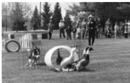
Link students observe a presentation on the "geese police" at Novartis Pharmaceutical's Take Your Children To Work Day .

The activities enabled students to explore many facets of Novartis' pharmaceutical work, from chemistry experiments to animal testing of drugs, from publishing/printing to recycling, from telecommunications to diversity. While