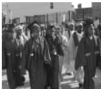
The graduates outside the church.