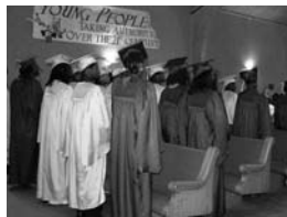
The Class of 2007 stands and formally recognizes their families for their constant support, love and encouragement.

possible. Students then left their seats, offering a small token of appreciation to their families for their love and encouragement.