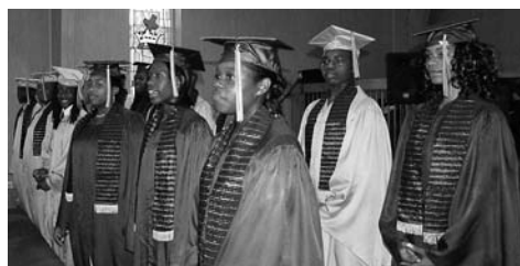
The graduates sing the school song, All Hail LCS!