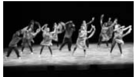
Link students perform in NJPAC’s Victoria Theatre at Link’s premier benefit event, A Taste of Newark.

The event began with a tasting of some of the best food in Newark. Fourteen culinary establishments from